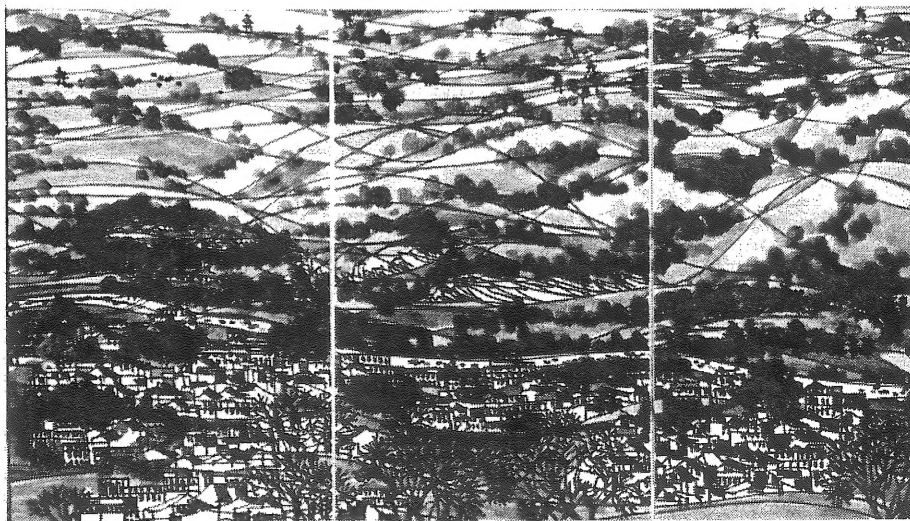
Zhuóguāng Zhao, sketch for mural Spring in Cupertino , 1995. Watercolor, ink, 11"x21".